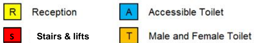
Ground Floor Layout