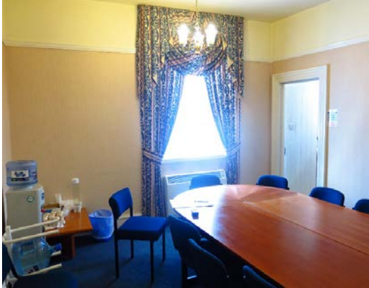
Typical Jury room

Witness rooms can easily be reached on the ground floor by all users.