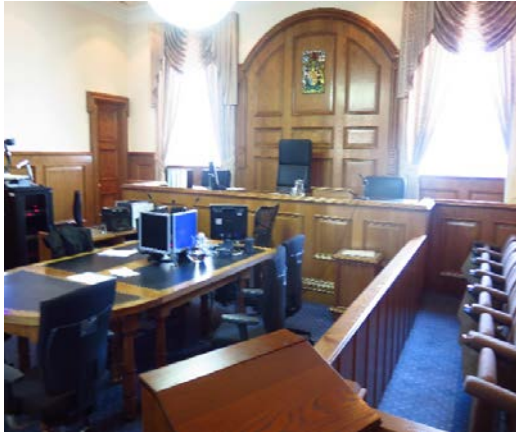
Typical court room