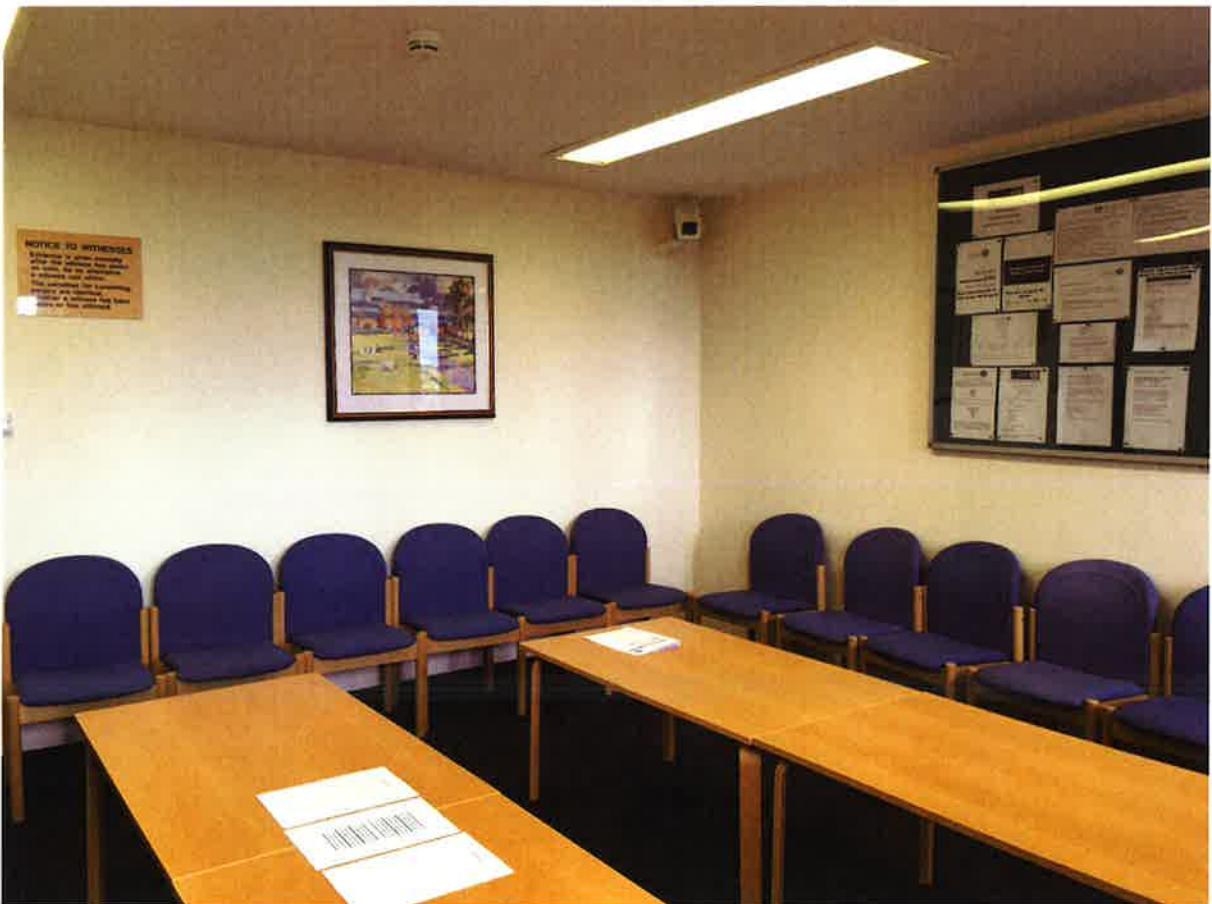
(Typical Witness Room)

There are 6 Witness Rooms in the Court, they are all spacious and can accommodate wheelchair users and persons with restricted mobility. Comfortable seating; reading materials and some free puzzles are also provided. Staff from Witness Services are always available when there are trials running to offer support and assistance to witnesses on the day.