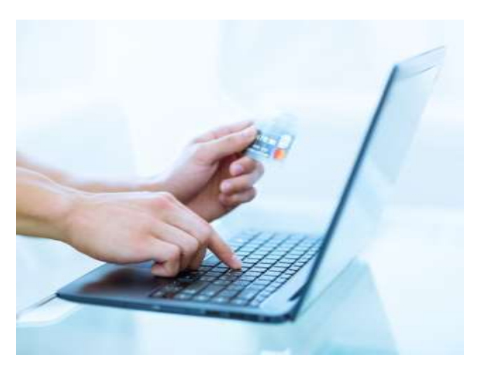
Online payment of fees and fines offers convenience to the user and efficiency and security to SCTS

Whilst contact with the system may be an infrequent experience for most that does not mean that our customers will expect routine transactions to be inconvenient – they will expect courts and tribunals to be able to deal with a range of transactions online. It is in their interests, and ours, that we should be able to do so.