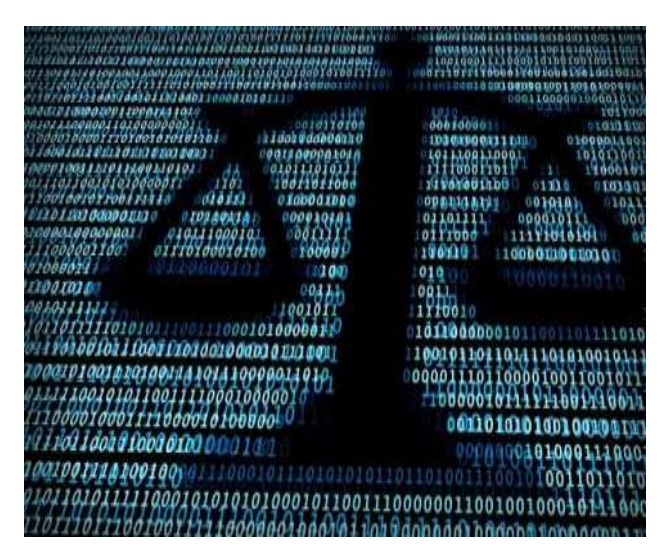
Maintaining a modern infrastructure is fundamental to providing digital services that the public can trust

In addition to paving the way for services to be delivered in more effective ways our core infrastructure forms a key part of the backbone which keeps SCTS running every day. As the judiciary and staff of the SCTS work to improve the administration of justice we must ensure they have the tools to do so – supported by a flexible, resilient infrastructure through which they can transact, communicate and administer the business.