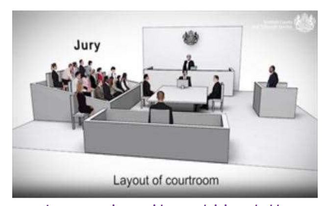
Jurors can view a video explaining what to expect before attending court

The <u>SCTS website</u> contains a range of static and dynamic advice and information that is accessed frequently by both professional court users and members of the public. Traditional information such as static pages on types of procedure and advice on what to do in particular circumstances is complemented by more modern content such as <u>video guides</u> on what to expect in court if you have been cited as a potential juror. In addition to the core SCTS website we manage around 20 other websites providing information on a range of tribunals and the work of the <u>Office of the Public Guardian</u>. We also provide advice and information that is hosted on <u>mygov.scot</u>, which acts as a hub for information on public services in Scotland.