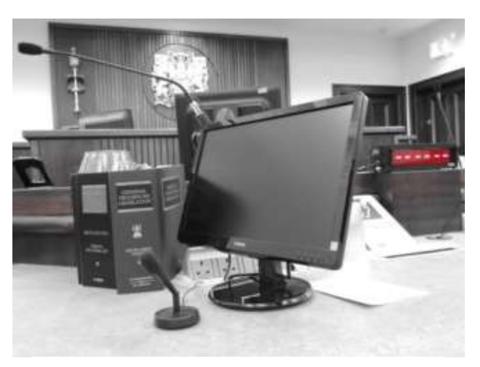
Criminal Courts – a mixture of old and new technology

Behind each of those numbers are people who may have been the victim of an offence, witnesses caught up in events and often children or vulnerable people who have been affected. As well as doing our business efficiently we have a duty to administer justice – and a desire to do so in a way that supports those people as much as possible. New technology provides us with an opportunity to look at the way criminal business is managed and take steps to improve both its efficiency and effectiveness.