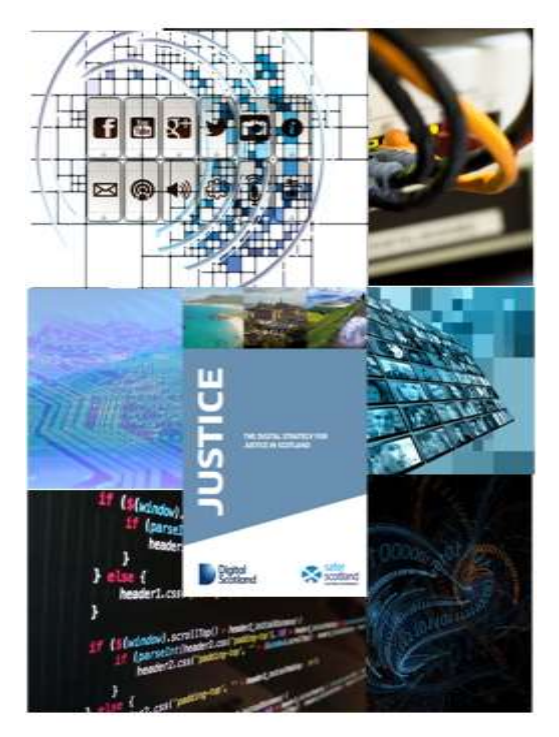
Our approach to digital is informed by our broader plans and programmes of work

Each of our programmes brings together the right people to consider how the operation of the system can be improved – and the role that digital services and new technology could play in that improvement. They also consider the sequencing of activity, with a view to avoiding the risk that we invest in automating existing ways of working without asking whether they are as effective as they can be and whether the potential benefits of technology may require the way in which we do business to be reconsidered.