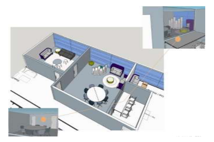
Hearing Room plans for the new video evidence suite in Glasgow

A suite of evidence taking facilities will be opened in the state-of-the-art Glasgow Tribunals centre, alongside a supporting control room and editing suite. These rooms will be multi-functional, supporting the work of both the courts and tribunals. Three vulnerable witness rooms with special furnishings will also be provided. Young people have been involved in the design of these facilities, with the aim of minimising the stress and trauma of giving evidence - using multiple discreet cameras and mirrored glass to create a more reassuring environment.