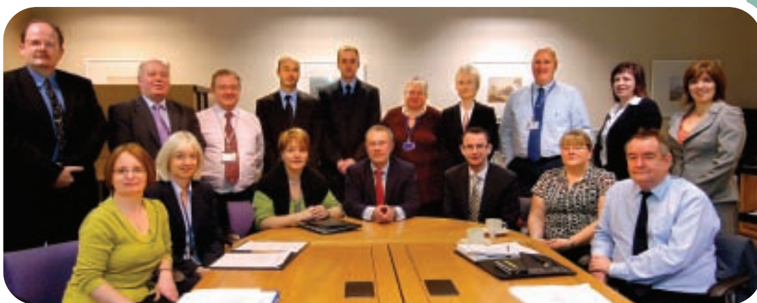
L&B Transitional Arrangements Implementation team meet in Edinburgh Sheriff Court.